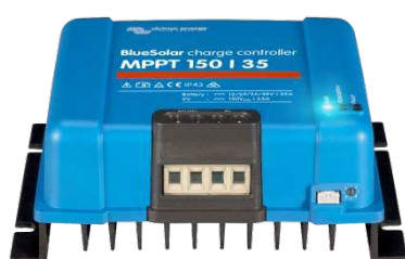
Solar Charge Controller MPPT 150/35