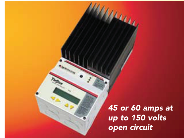
Product shown with optional meter.

Morningstar's TriStar MPPT solar controller with TrakStar Technology™ is an advanced maximum power point tracking (MPPT) battery charger for off-grid photovoltaic (PV) systems up to 3kW. The controller provides the industry's highest peak efficiency of 99% and significantly less power loss compared to other MPPT controllers.